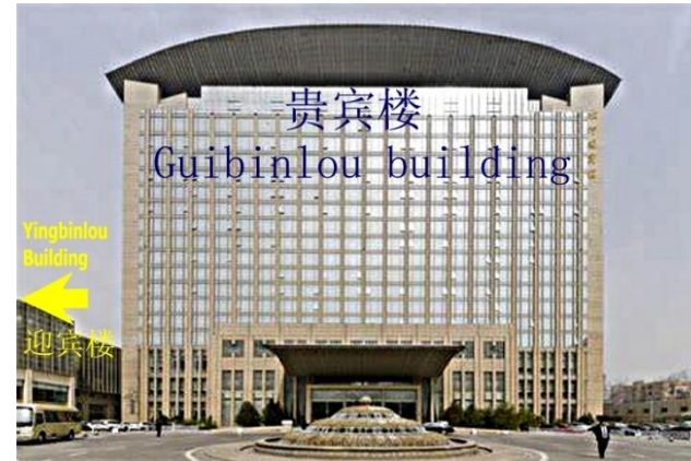
Front view of the Taihang State Guesthouse.