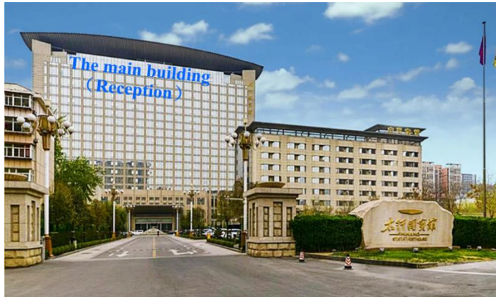
Front view of the Taihang State Guesthouse.